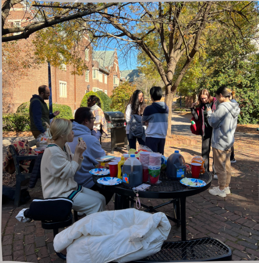
Marsh Hall, Building-Wide Event

The Spider Residential Experience (SRE) is our initiative to build community within the residence halls here at the University of Richmond focused on answering the question: What do we want students to learn as a result of living on campus at UR?